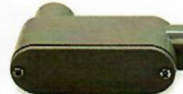
PVC LB conduit body