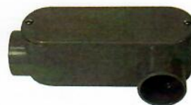
PVC LL conduit body