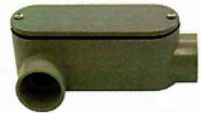
Aluminum LR conduit body