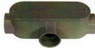
PVC T Conduit Body